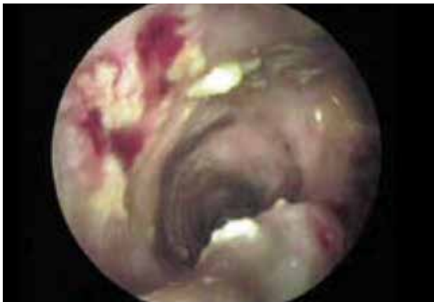
Video-otoscope photo of Pseudomonas ear canal

University researched and tested. Available in 4 ounce and 16 ounce bottles.